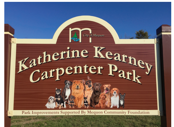
Carpenter Park Improvements