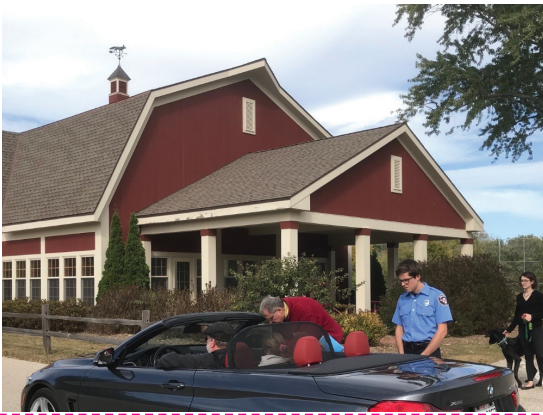
MCF Road Rally at Sommer Pavilion

Since 1999, over $750,000 has been granted to support many local projects.