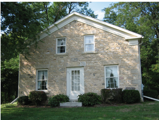
Jonathan Clark House Museum